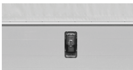
smooth and simple opening mechanism